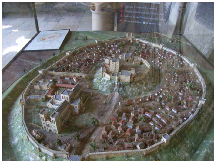
The Cathedral at Old Sarum

In a similar manner today's Freemasons use handshakes and words to help recognize each other. As the work was heavy in nature, Men were the ones employed as Stone Masons. It is with this tradition in mind that women are not accepted as members.